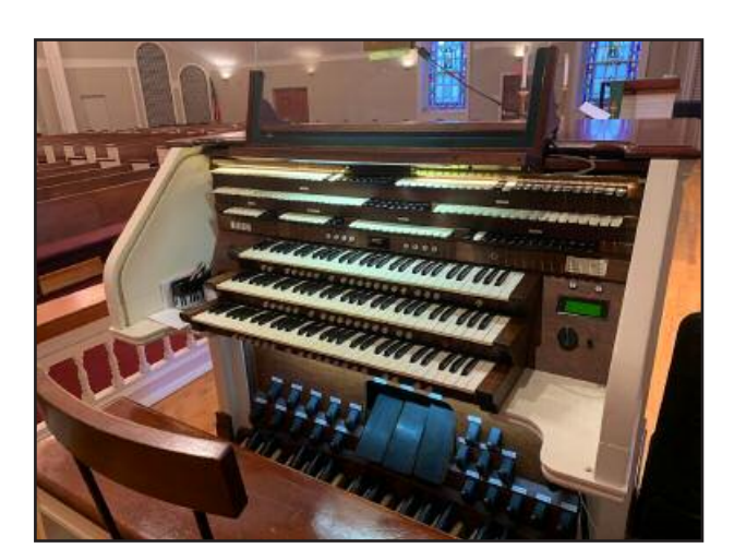
Where is this instrument?

Last month's photograph was taken at First Baptist Church at 17th and Sansom Streets in Philadelphia. After the new owners of the building decided to remove the instrument, it was acquired by the Church of the Holy Trinity on Rittenhouse Square, restored mechanically, and is being installed in the rear gallery.